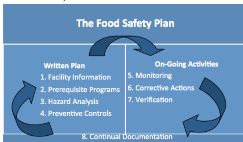
Figure 2: Conceptual Example of a Food Safety Plan

This is one of the key rules that was expected to be released in January 2012 but has been delayed. All members of the food supply chain should pay close attention to these requirements and related guidance documents as soon as they become available.