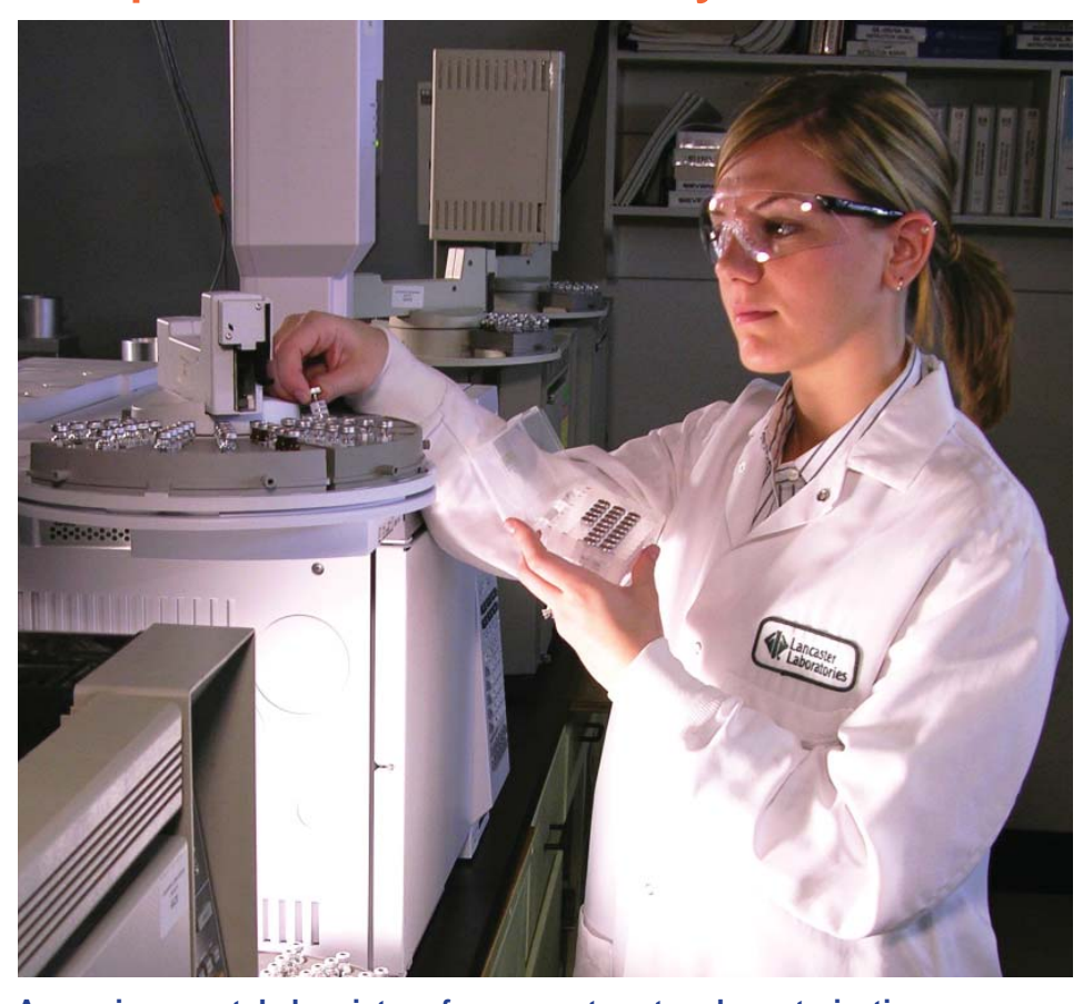
An environmental chemist performs wastewater characterization.

members allow accommodation of rush turnaround times for spill, emergency response disposal and other projects.